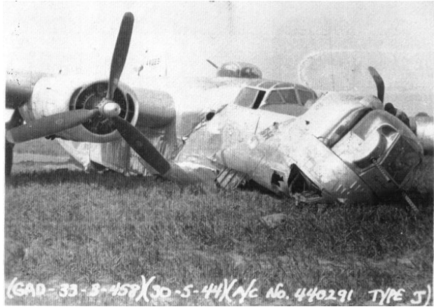
30 May 1944 - 2Lt McCarthy crew crashed on take off