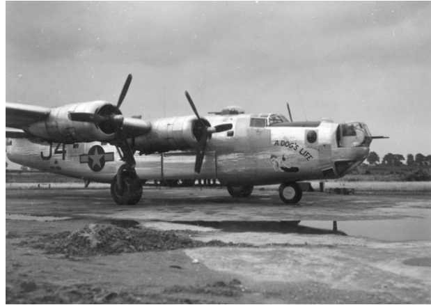
13 February 1945 - Lt Lawrence Shannon crew crashed on take off