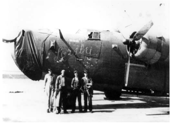
"Lorelei" pictured with unknown aircrew in April 1944 (note 16 mission symbols)